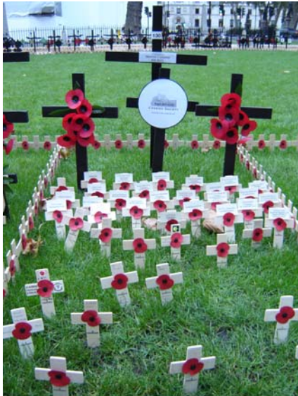
The Monte Cassino Society plot in the Field of Remembrance

In November I was in England for the opening of the Field of Remembrance at Westminster Abbey and the March Past the Cenotaph on Sunday, November 11 th .